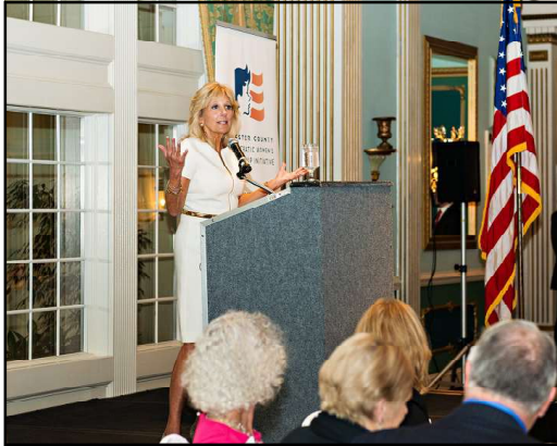
Dr. Jill Biden speaking at CCDWLI Fall Gala

The Chester County Democratic Women's Leadership Initiative (CCDWLI) had a very active year. In January, we chartered several buses to the Women's March on Washington. In February, we hosted the PA Statewide Democratic Judges at our Judicial Forum.