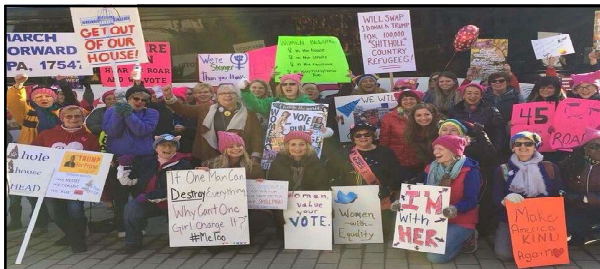
"Roar of the Roses", White and Red Roses of York and Lancaster Counties at the Women's March in Philadelphia.